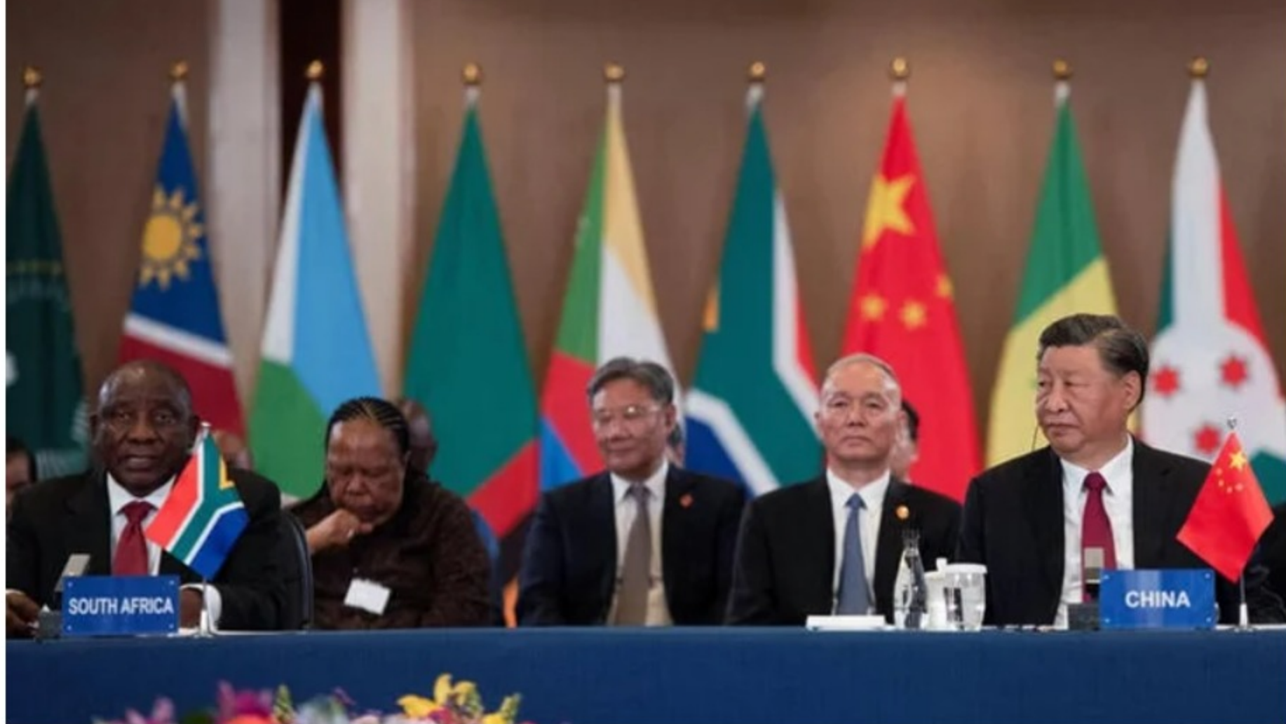
President of China Xi Jinping and South African President Cyril Ramaphosa attend the China-Africa Leaders' Roundtable Dialogue on the last day of the BRICS Summit, in Johannesburg, South Africa, August 24, 2023.

The bloc's new members including Egypt and Ethiopia need a counterweight to a world financial order which has ignored them for too long, experts argue.